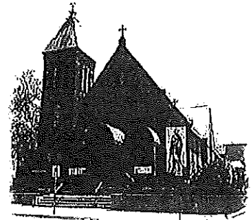
St. Paul's, Highland Park